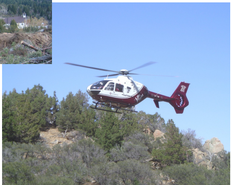
Life Flight lands near Thomas Lake