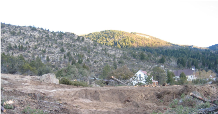
Dan Burke Memorial Landing Zone under construction with War Eagle Mountain in the distance

Dan is survived by his brothers, Kevin and Kim Burke, managing owners of 4B Company. As good neighbors and in honor of their late brother, 4B Company signed an agreement allowing SCF&R to establish a helicopter landing zone for emergency use on the southwest corner of their patented, Morningstar/Burro Mine property. The new LZ is located at the north edge of town. SCF&R volunteers have cut juniper, cleared brush, and prepared a level landing pad. The site is optimal for landing helicopters in the area's prevailing northwest and southeast winds. The Landing Zone is for emergency use only, with road access for emergency vehicles only. This landing zone will always be available and unobstructed. It will provide a great service to the town and better outcomes for patients. We thank the Burke family for their generosity and service to Silver City. SCF&R will place a plaque at the LZ in honor of Dan's memory. Kevin and Kim commented that establishing the LZ is what Dan would want to do.